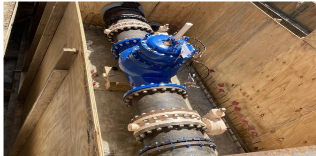
48" TWM Installation on E. 35 th Street / QMT Approach

The New York City Department of Design and Construction (NYCDDC) continues to manage the $37 million dollar capital construction Infrastructure Upgrade Project #MED607. Work includes, but is not limited to, the installation of catch basins at various locations, utility upgrades, limited sewer upgrades, new hydrant installation and the installation of new water main pipes in various locations. This project has an anticipated completion date of January 2025.