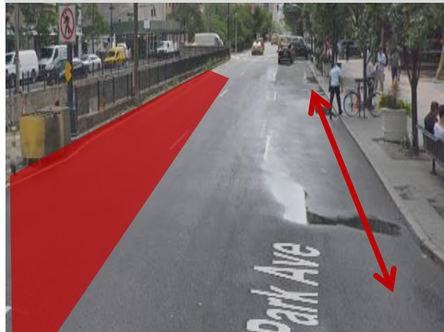
Temporary Lane Closures Between E. 38 th Street and E. 40 th Street