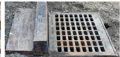
E. 33 rd Street at 3 rd Avenue