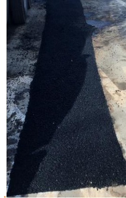
2 nd Avenue at E. 36 th Street