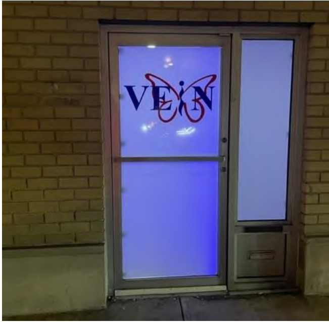
30 Park Avenue, as of 2/8/2023