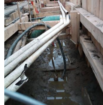
Trunk Water Main Trench W/S of 2 nd Ave. between E. 34 th St. & E. 35 th St.

Distribution of Construction Newsletters for this project are within the footprint of the project & Manhattan's Community Board #6.