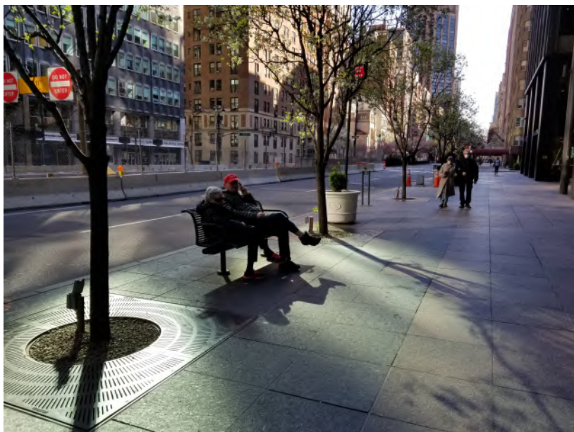
Park Avenue at 40th Street on Friday, March 27 at 4:45pm.

Governor Cuomo launched the NY Stronger Together campaign urging New Yorkers to stay home, stop the spread and save lives. View La La Anthony's video twitter.com/NYGovCuomo/status/1242086405658030080 .